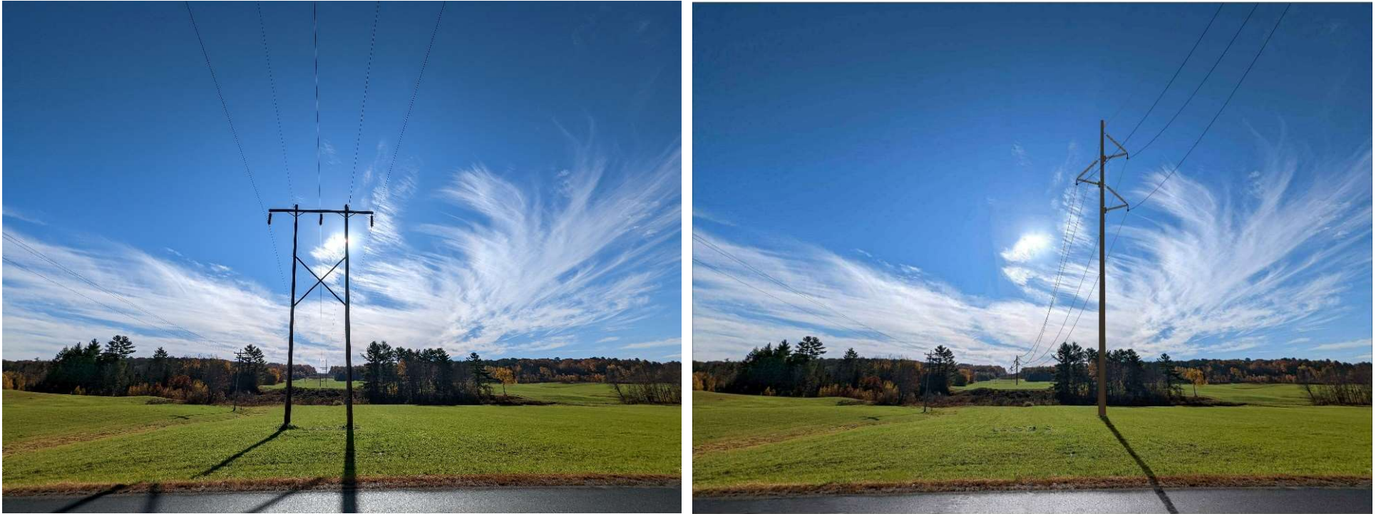
Wingood Road. Present and Planned. Not shown is vegetation clearances.